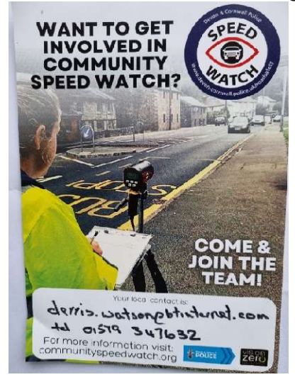
Figure 1: Speed Watch Contact Details

The teams worked with a minimum of 3 volunteers and safety was paramount. Contact details to volunteer are included on figure 1.